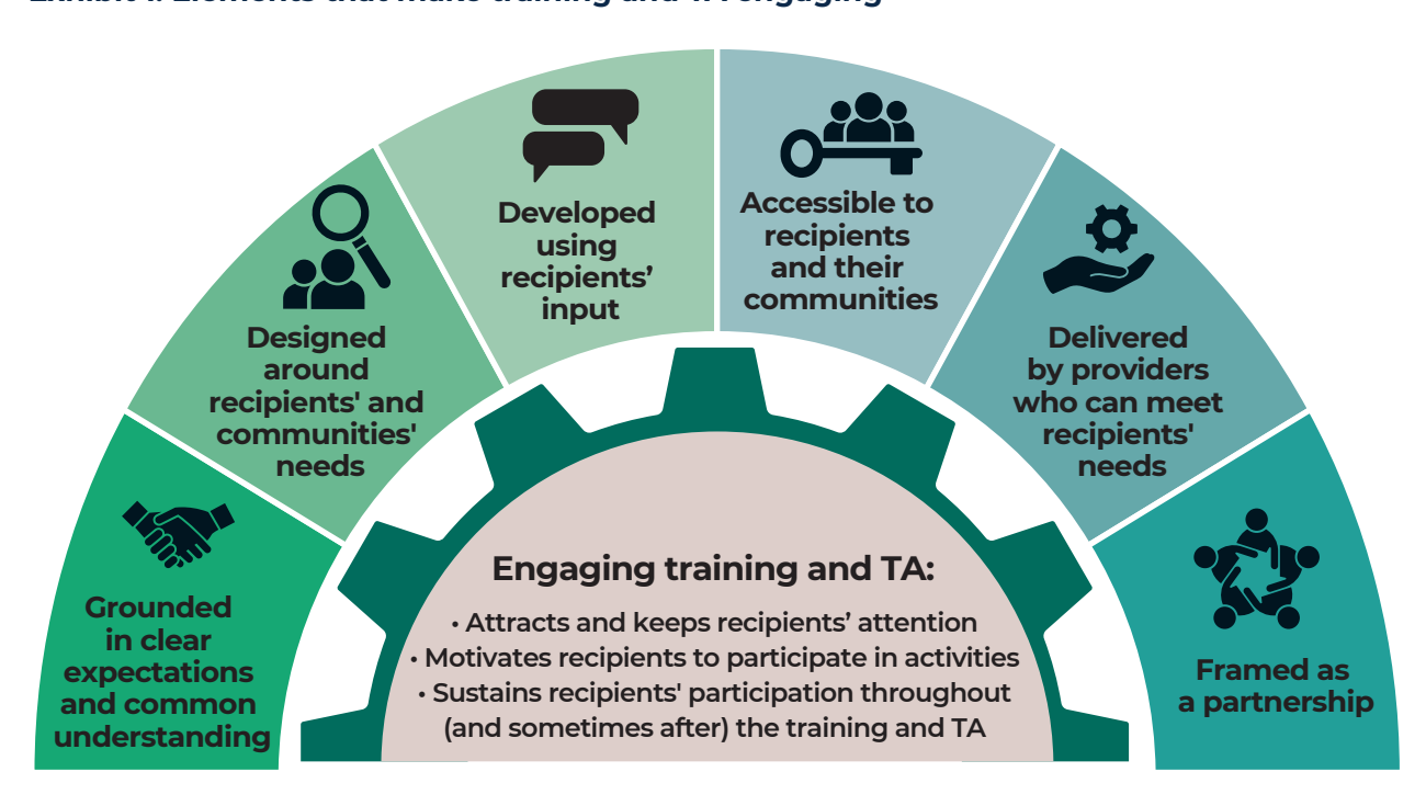
Exhibit 1. Elements that make training and TA engaging